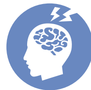
Inflammation of the brain (encephalitis)