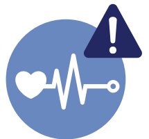
Can be severe and/or fatal